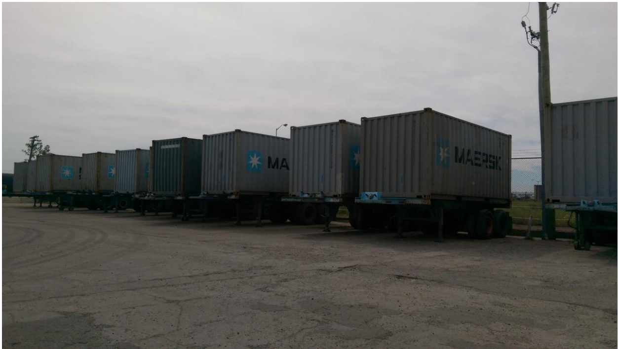
Inspected Containers of Soybeans Ready For Export

20300 Mt. Elliott Street, Detroit MI 48234 (248) 860-7219 marketing@railmark.com www.railmark.com