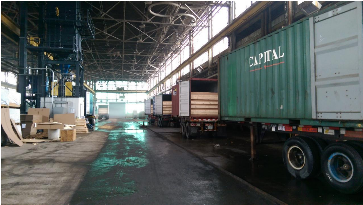
Cleaned, Inspected Empty Containers Ready For Grain Loading